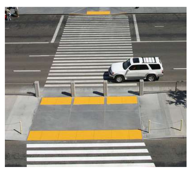
Tactile Walking Surface Indicator (TWSI) with Truncated Domes