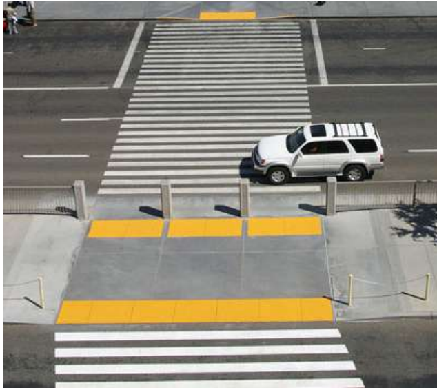
Tactile Walking Surface Indicator (TWSI) with Truncated Domes